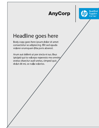
Don't lock up the Partner logo with the HP badge.