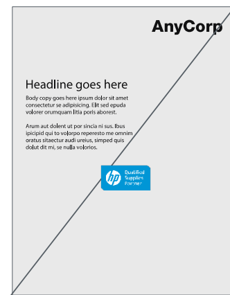
Don't float the HP insignia or use it to sign off body copy.