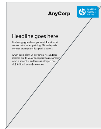
Don't place the Partner logo near the HP insignia.