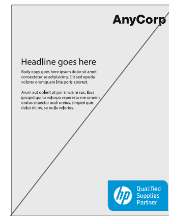
Don't make the HP insignia visually larger than the partner logo.